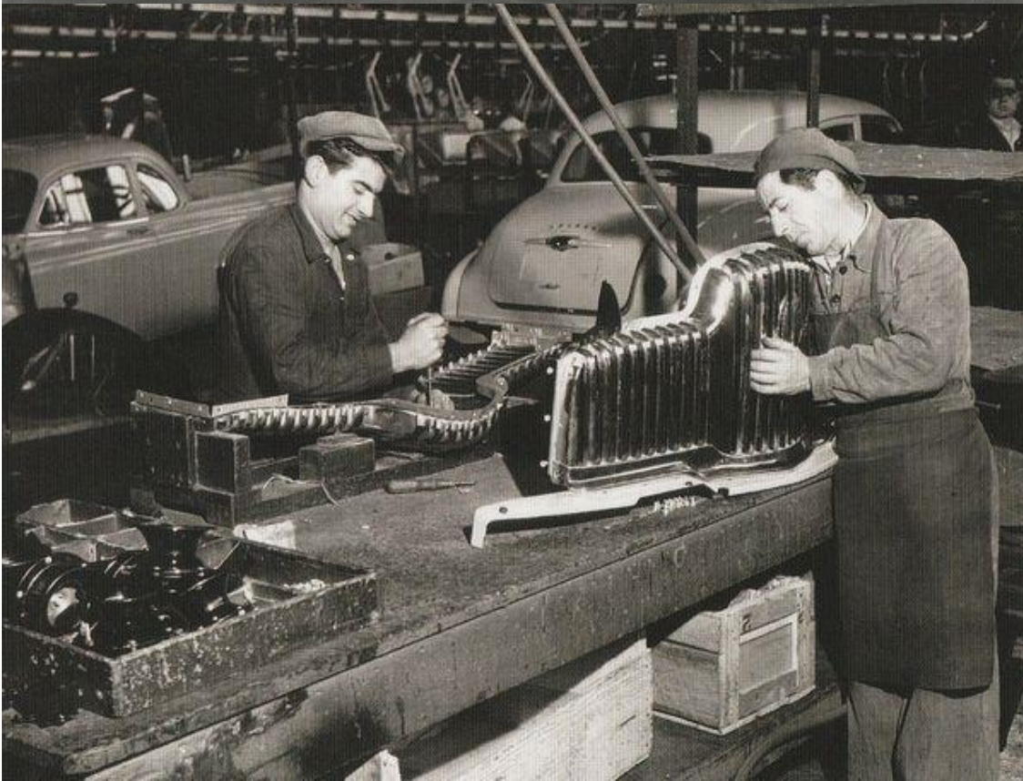
Holden FX Panel van Concept that never was and Grill assembly line