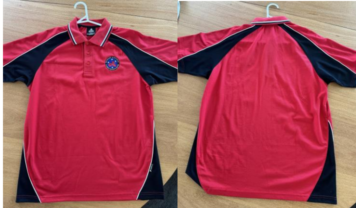
Large x 3 X/Large x 3